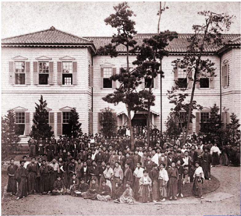
A group photo of our very first graduate students.

※Contributions to WASEDA USA, a tax-exempt organization under Section 501 (C) (3) of the United States Internal Revenue Code, are tax-deductible by persons subject to United States income taxation.