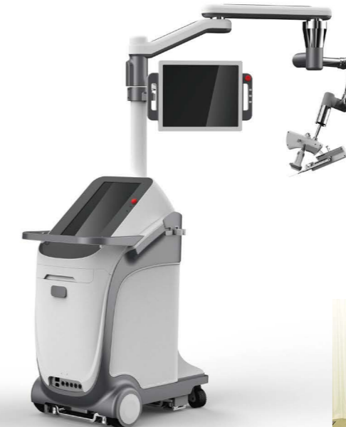
Robotic needle insertion system